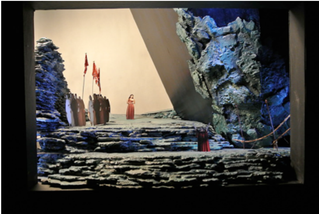
*Color Model "Iphigenia at Alus"*