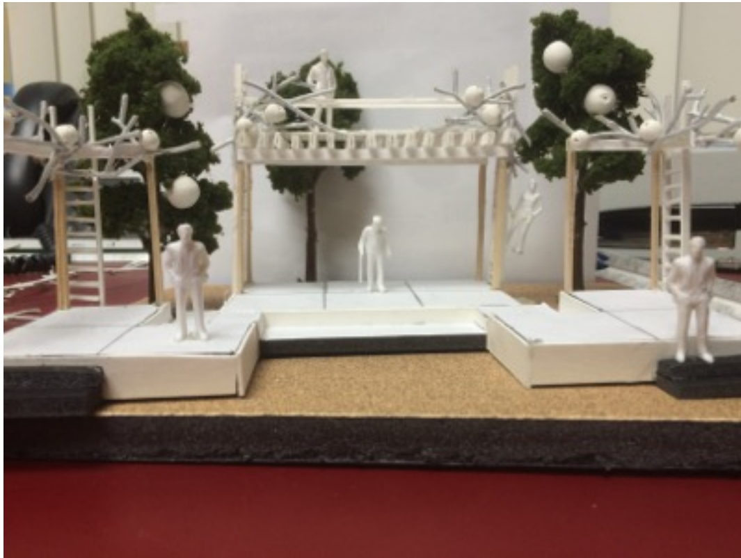
*White Model "Mid Summer Night's Dream"*