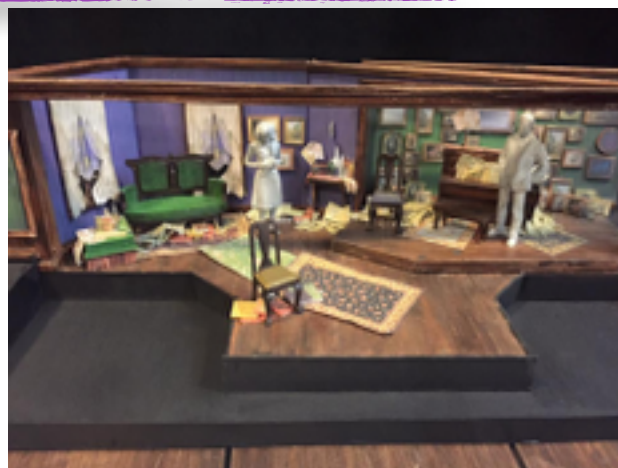
*Color Model "Devil's Music"*